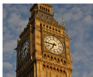
Brexit - UK economic prospects and outlook (The AIC)