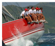
Markets Resume Upward Climb (ETF Global)