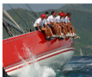
Stocks closed lower for the week after a sell-off on Friday (ETF Global)