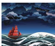
Navigating choppy waters (The AIC)