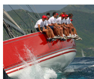
Stocks closed lower for the week after a sell-off on Friday